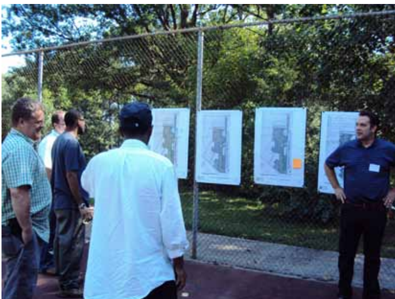
Community residents gather to view and discuss the completed Visioning Plan at Chosewood Park.

It is anticipated that it will take years or even decades to implement the projects identified in the community's Vision Plan. At this time, there is no dedicated funding to implement these projects. The community will have to facilitate fund raising. Having this completed , community-supported plan will be a strong tool toward this effort.