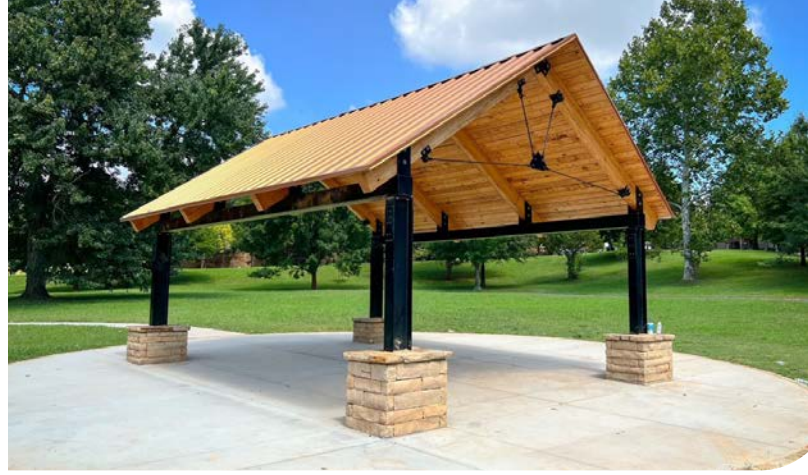
This beautiful pavilion at Dean Rusk Park in Atlanta was built with funding through Park Pride's Grantmaking Program.

Park visitors will soon be able to enjoy fitness equipment at N.H. Scott Park .