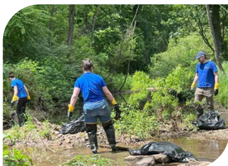
Georgia Power volunteers dove right in, removing trash from the wetlands.