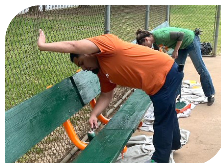
The dugout received a makeover with a fresh coat of paint on the benches.