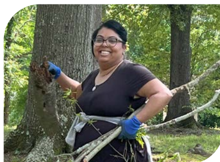
Volunteering with Park Pride is a great way to enjoy fresh air and time outside!