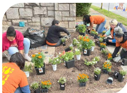
Newly planted garden beds at the park's entrance create a warm welcome for all visitors.