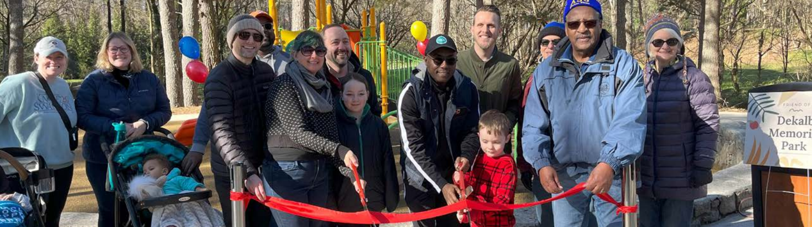
Above: Community members, Park Pride, DeKalb County Commissioners, and DeKalb's Recreation, Parks & Cultural Affairs staff cut the ribbon on a new playground at DeKalb Memorial Park, funded in part by a Park Pride grant.