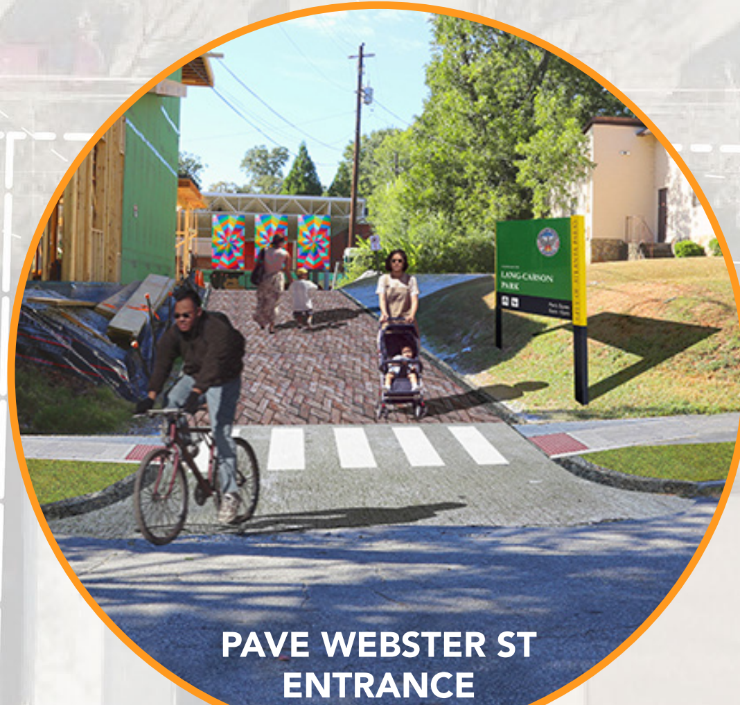
PAVE WEBSTER ST ENTRANCE

Prioritize neighborhood pedestrian access over car/truck accommodations