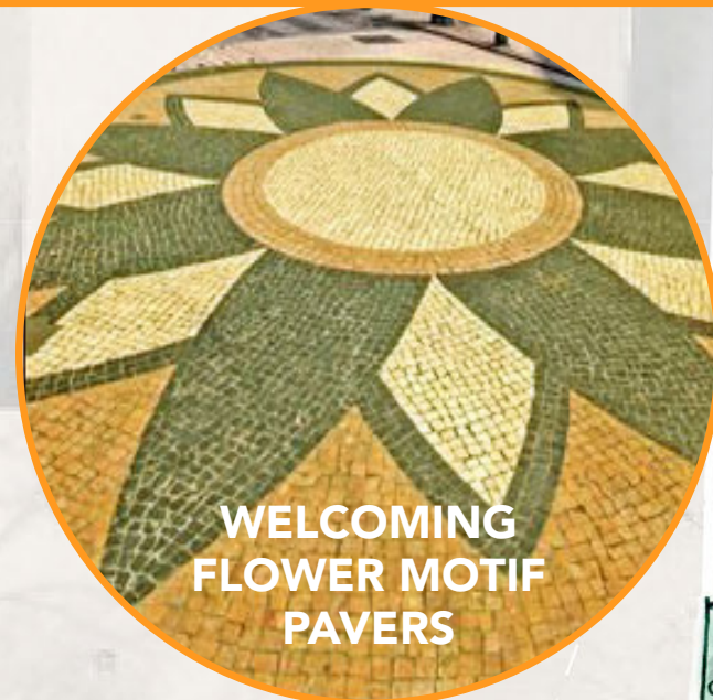
WELCOMING FLOWER MOTIF PAVERS

ADD PARK ENTRANCE SIGN AND PEDESTRIAN-ORIENTED PAVERS TO WELCOME PEOPLE INTO THE PARK, LIMITING VEHICULAR ACCESS TO SERVICE AND RESIDENTS