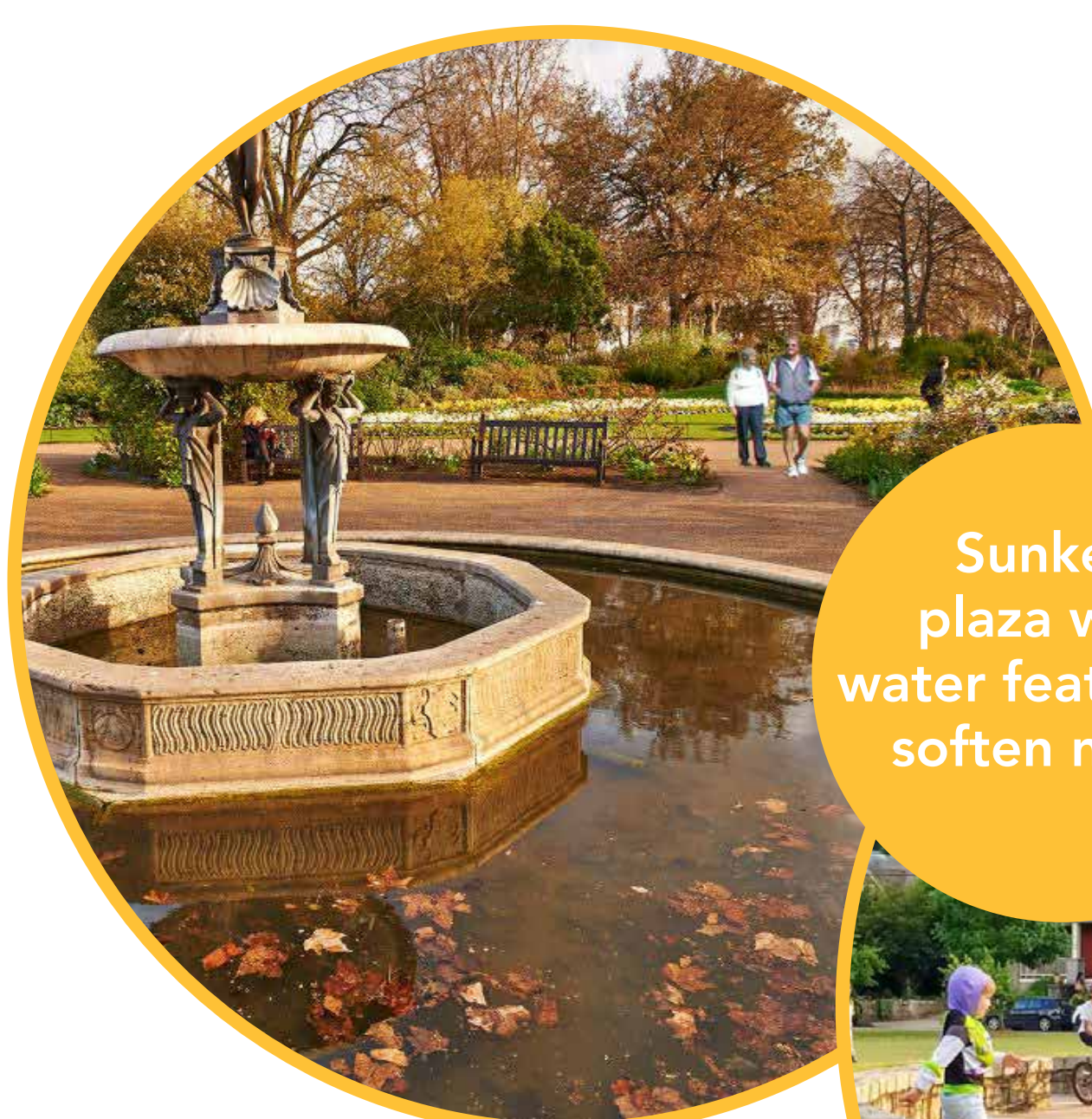
Sunken plaza with water feature to soften noise