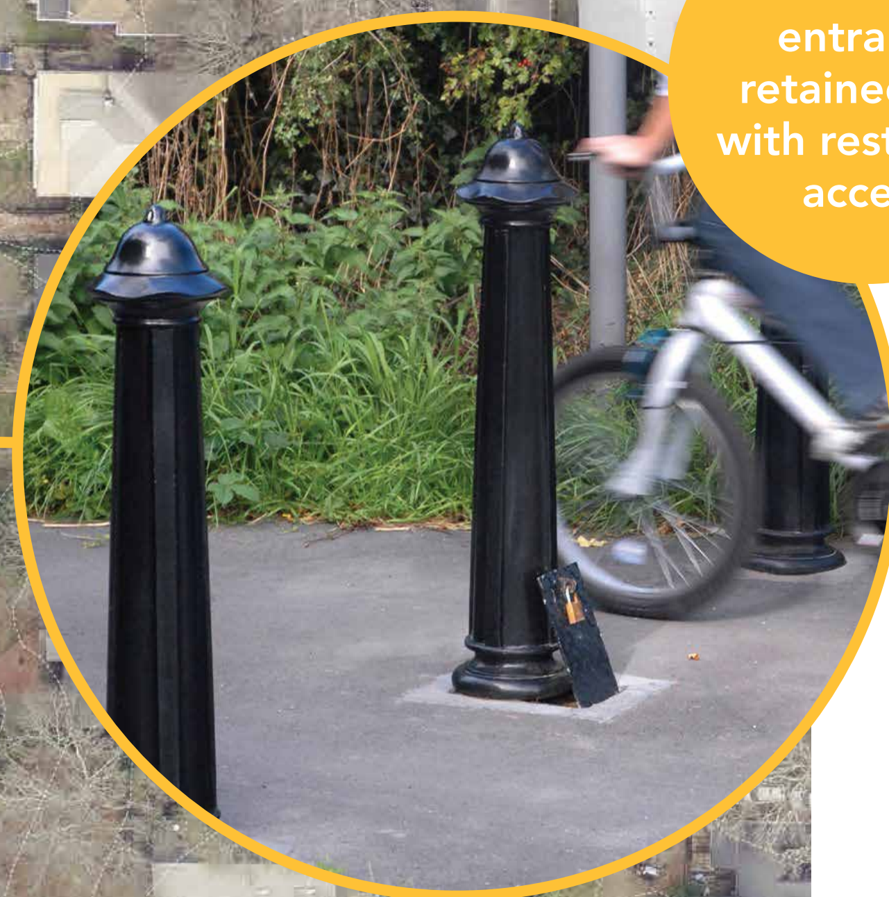
Existing entrance retained but with restricted access