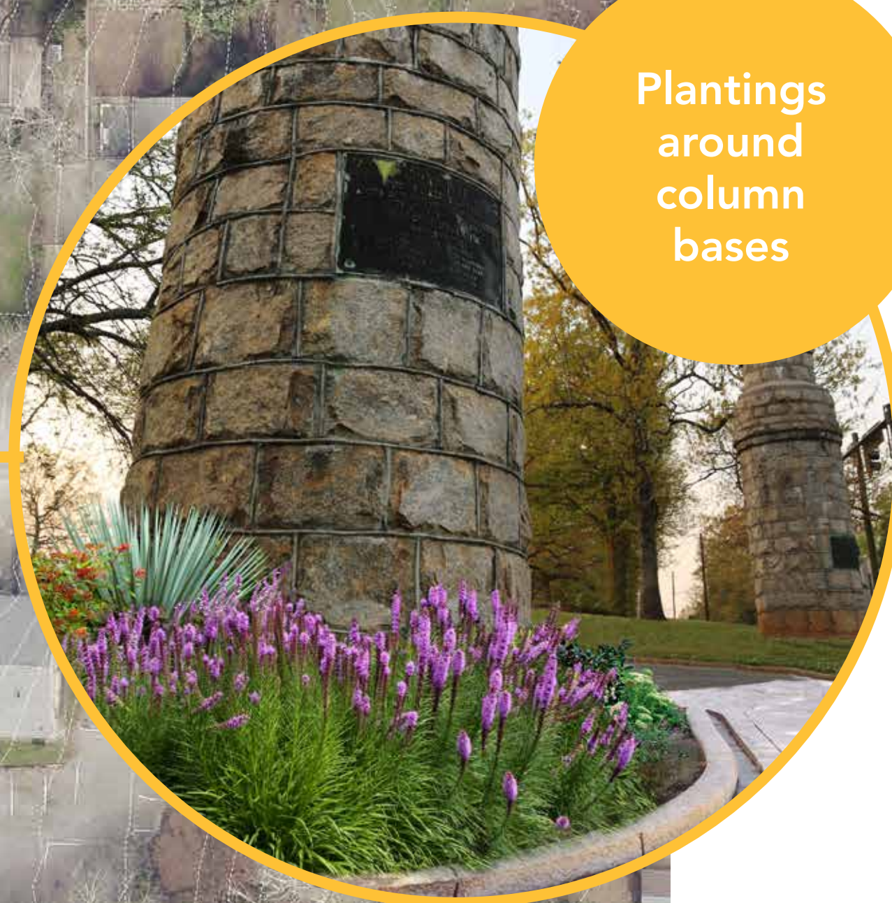
Plantings around column bases