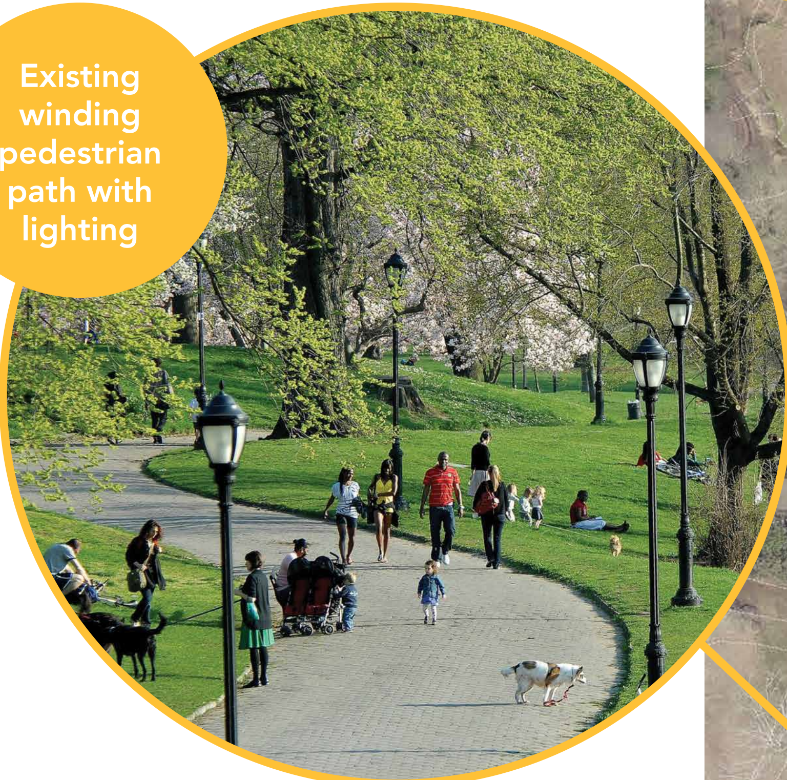
Existing winding pedestrian path with lighting