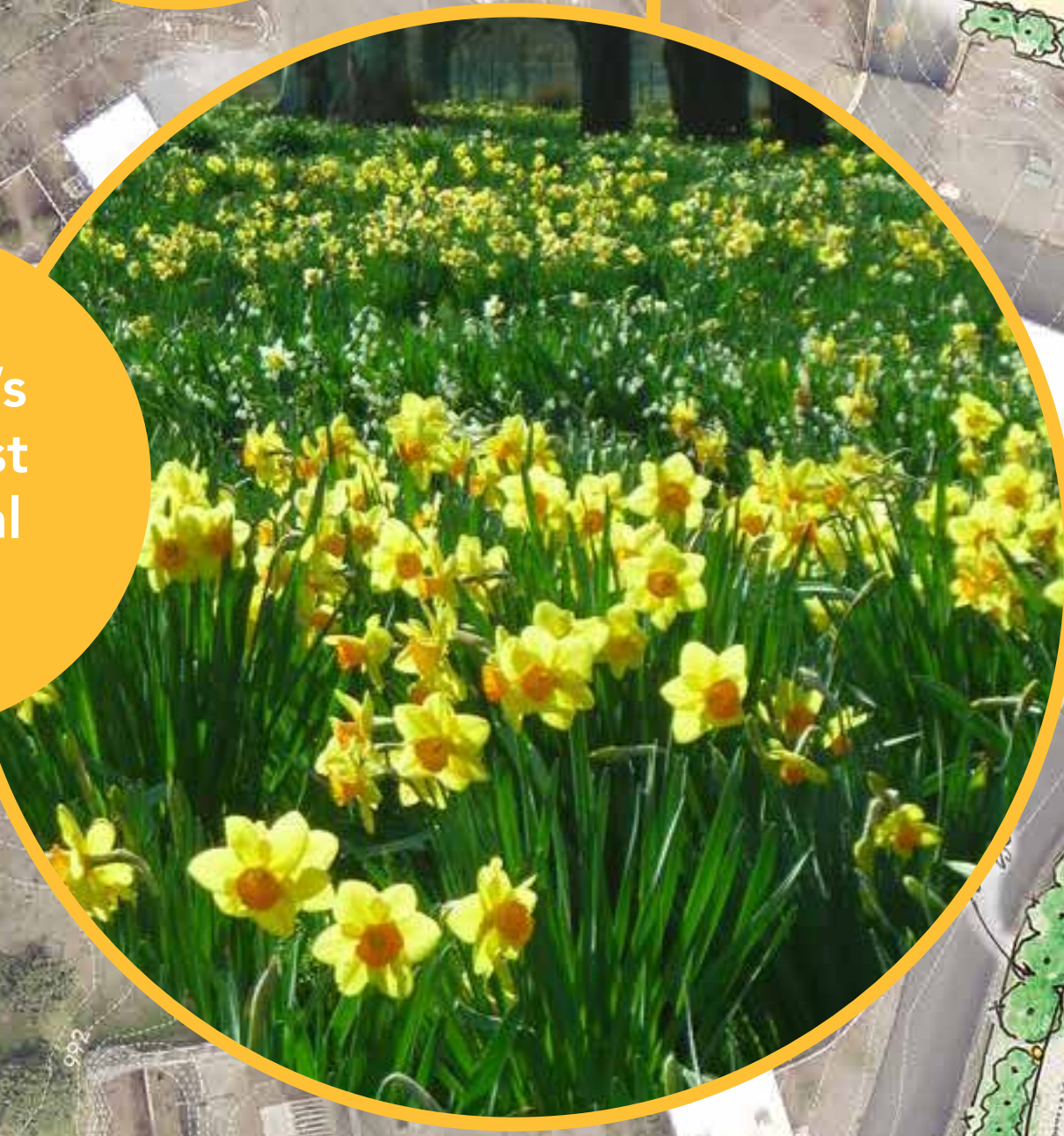
Children's Holocaust Memorial Project