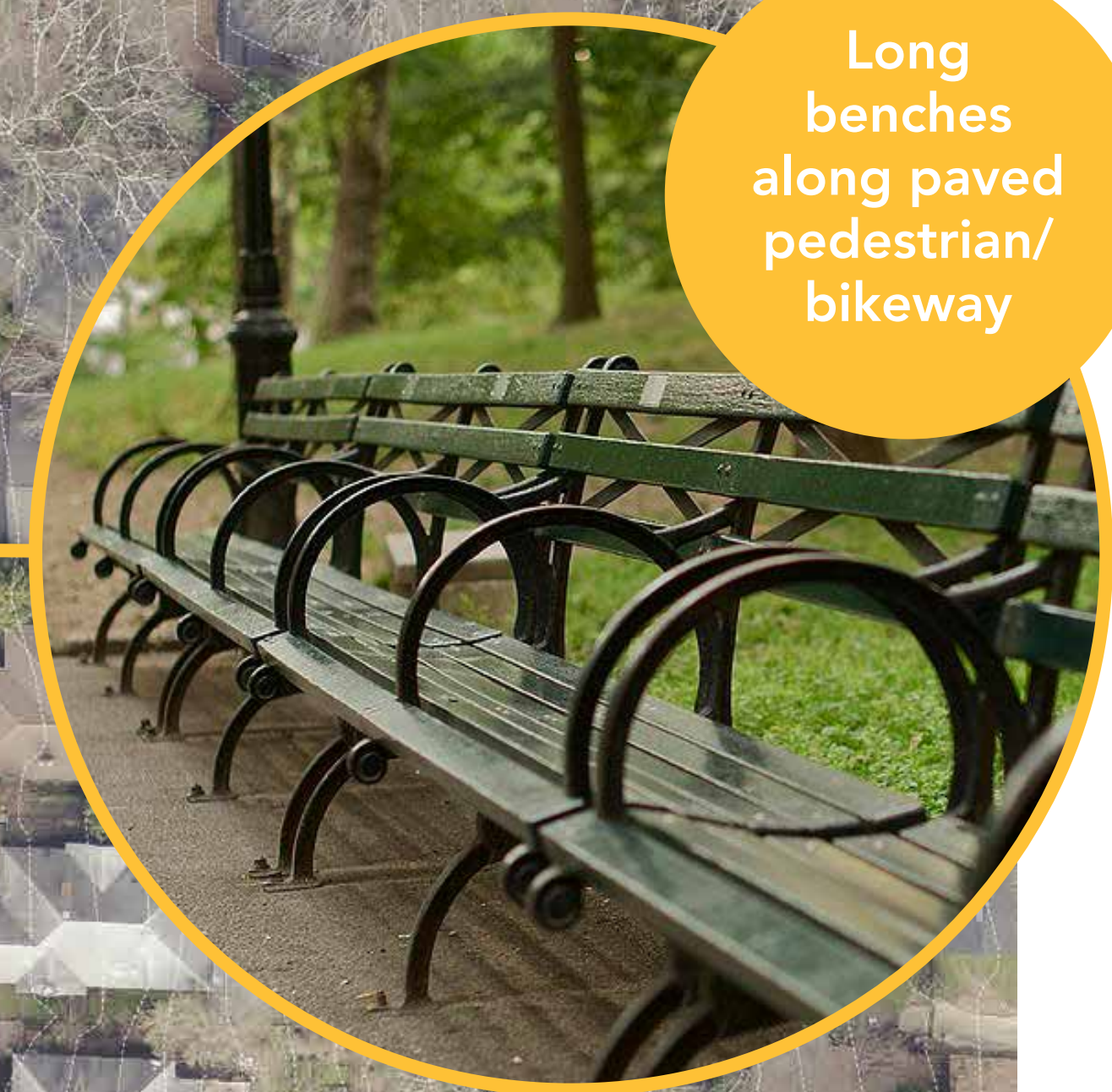
Long benches along paved pedestrian/bikeway