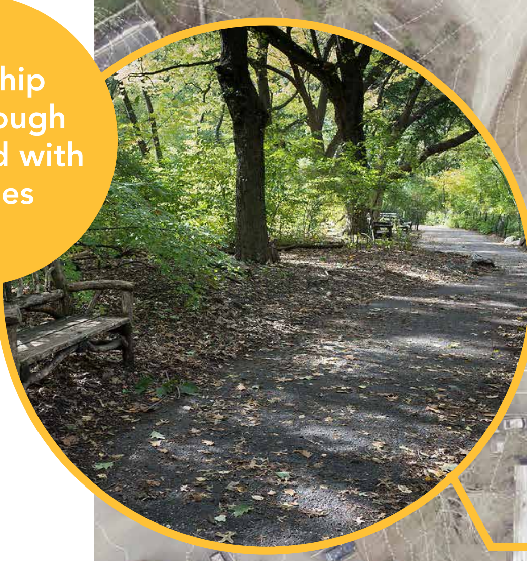
Slate chip trail through woodland with benches