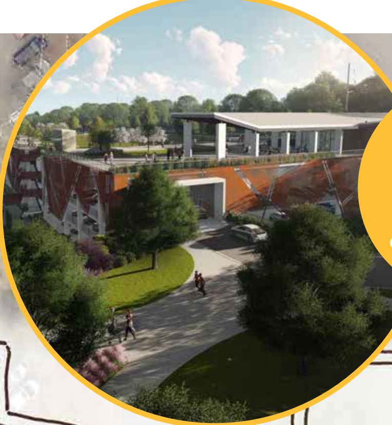
Gateway Project (under construction)