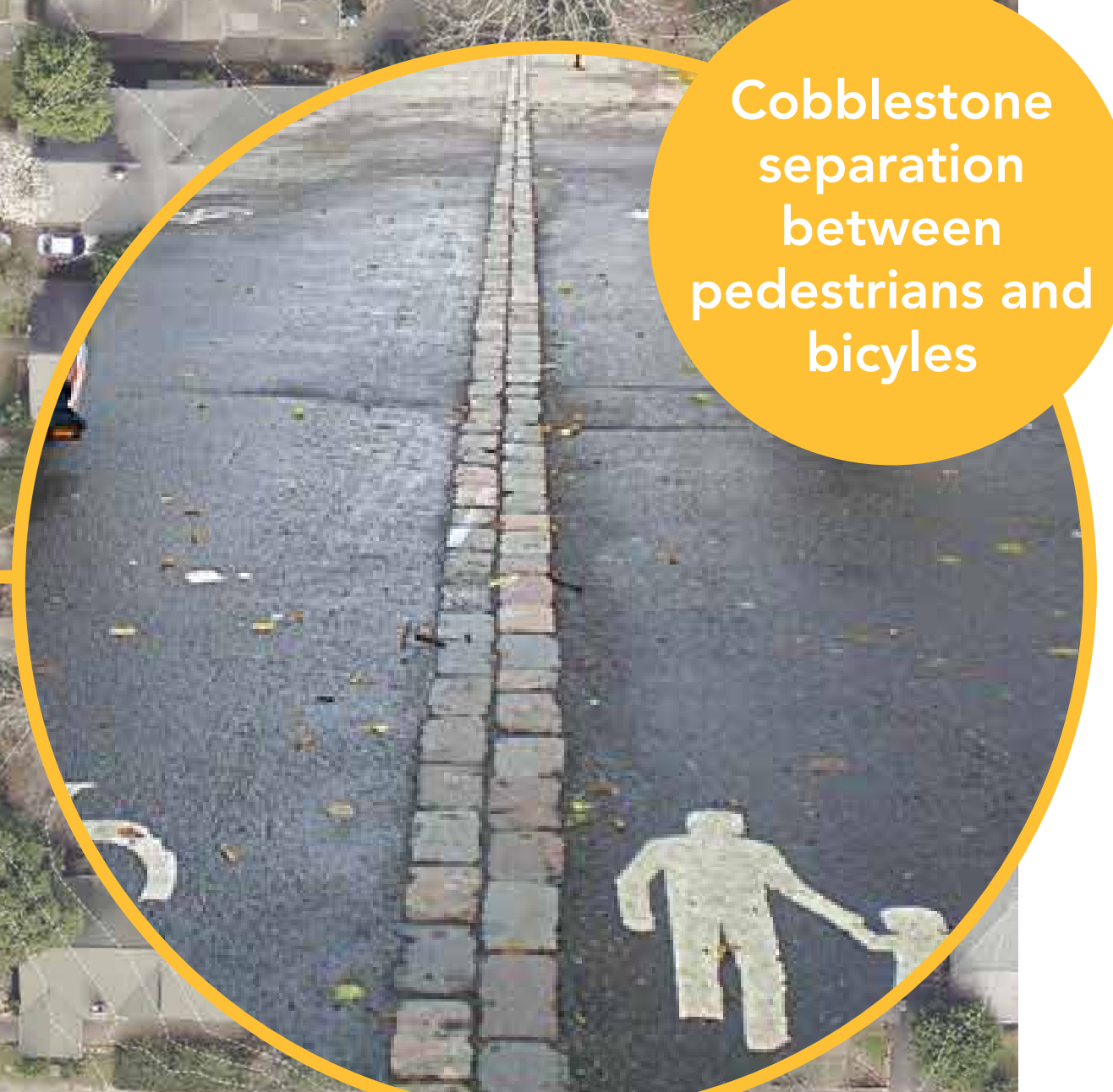
Cobblestone separation between pedestrians and bicycles