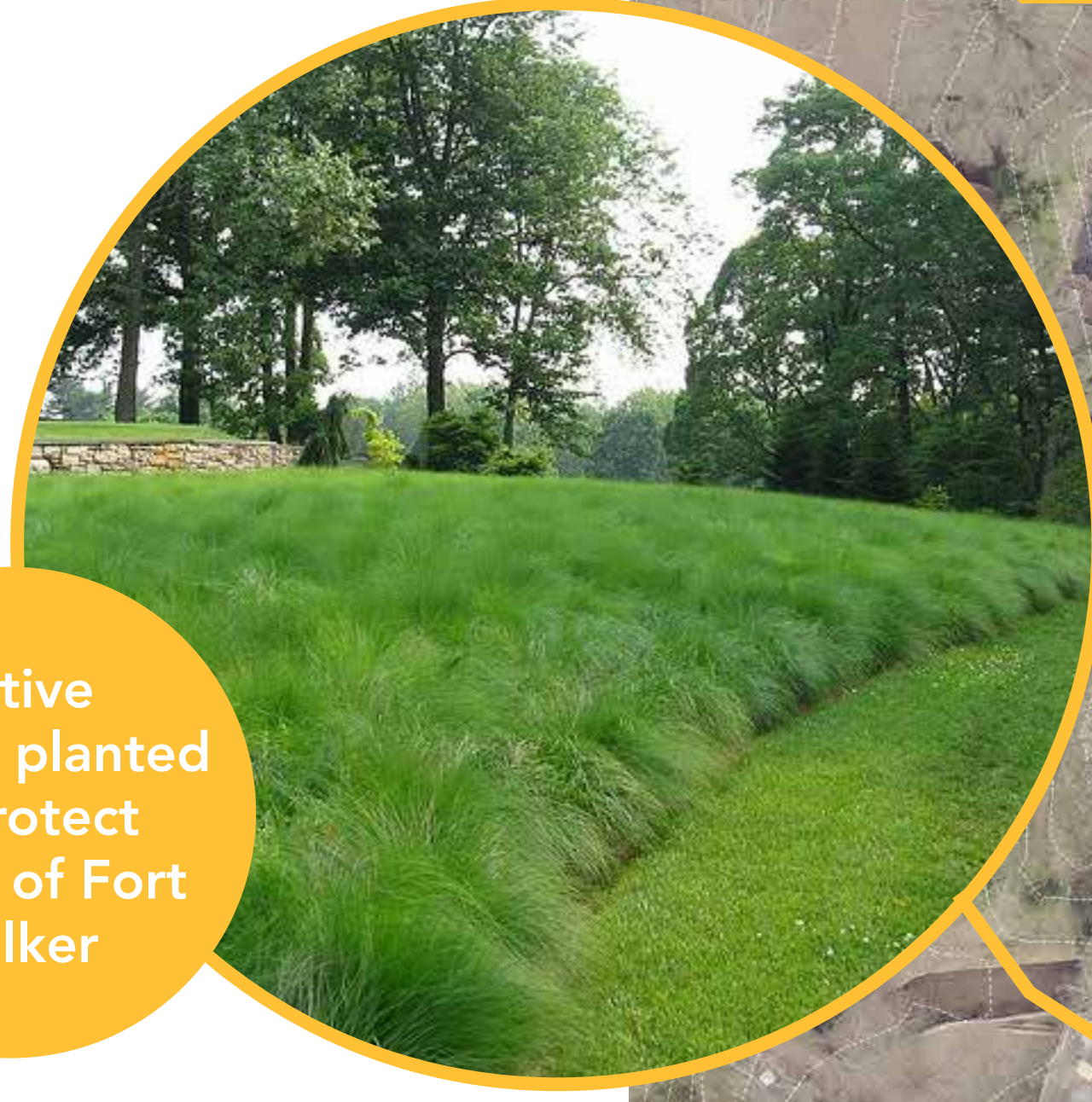
Native grasses planted to protect slopes of Fort Walker