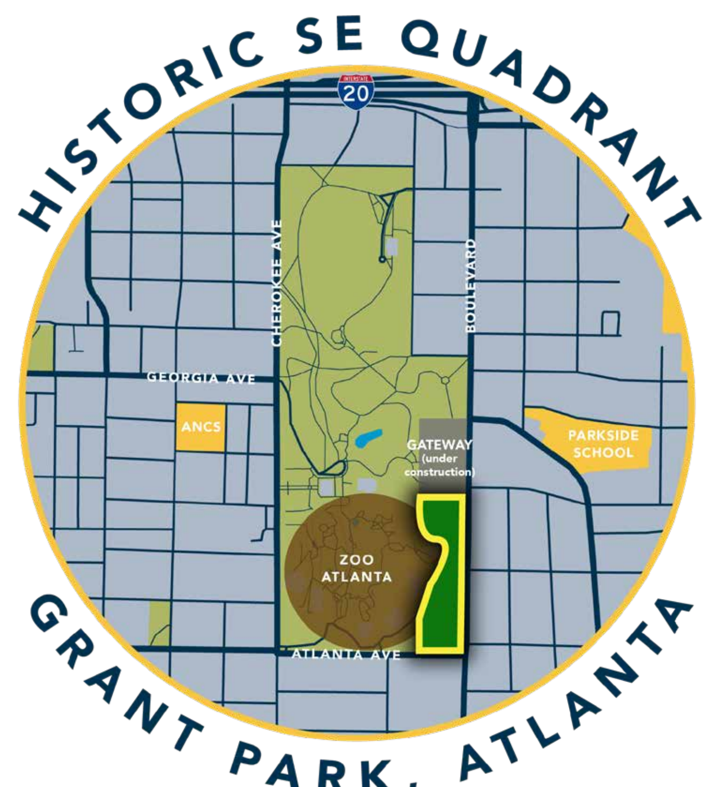
HISTORIC SE QUADRANT GRANT PARK, ATLANTA